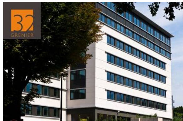
32 Grenier – Boulogne Billancourt