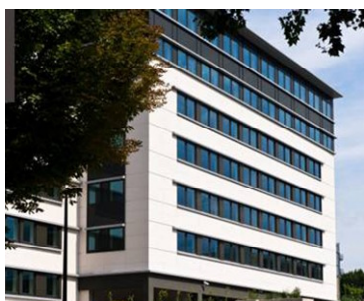
32 Grenier – 7,500 m 2 in Boulogne

Finally, the future headquarters of Eiffage Construction at Vélizy-Villacoublay, will be inaugurated at the end of November 2011. This 10,000 m 2 office block, leased to Eiffage on a 12-year firm lease, will have the BBC-Effinergie labelling.