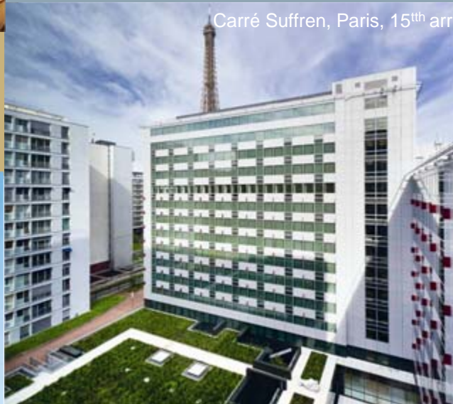
Carré Suffren, Paris, 15 th arr.