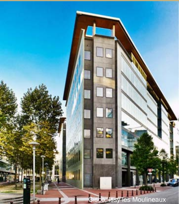
Cisco, Issy les Moulineaux