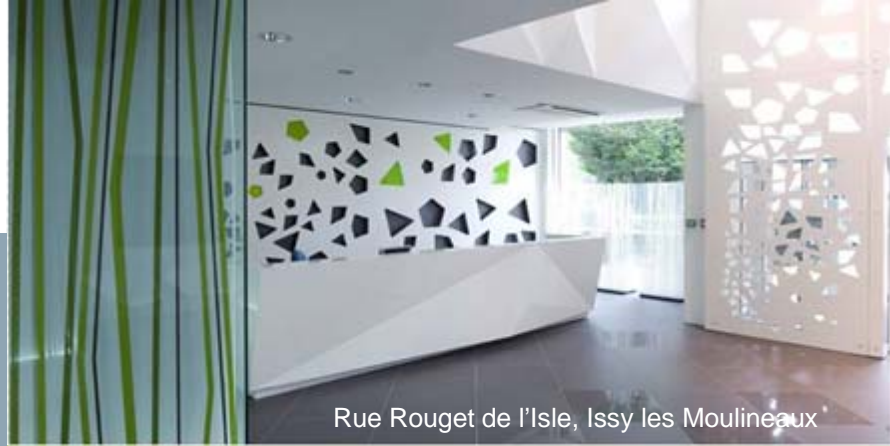
Rue Rouget de l'Isle, Issy les Moulineaux