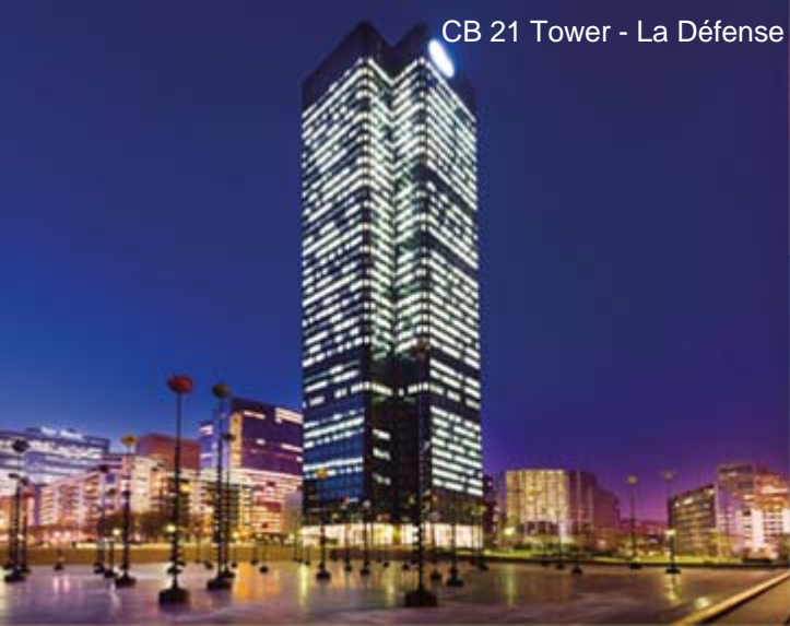
CB 21 Tower - La Défense