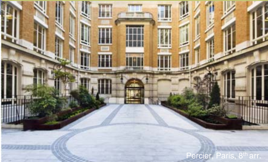
Percier, Paris, 8 th arr.